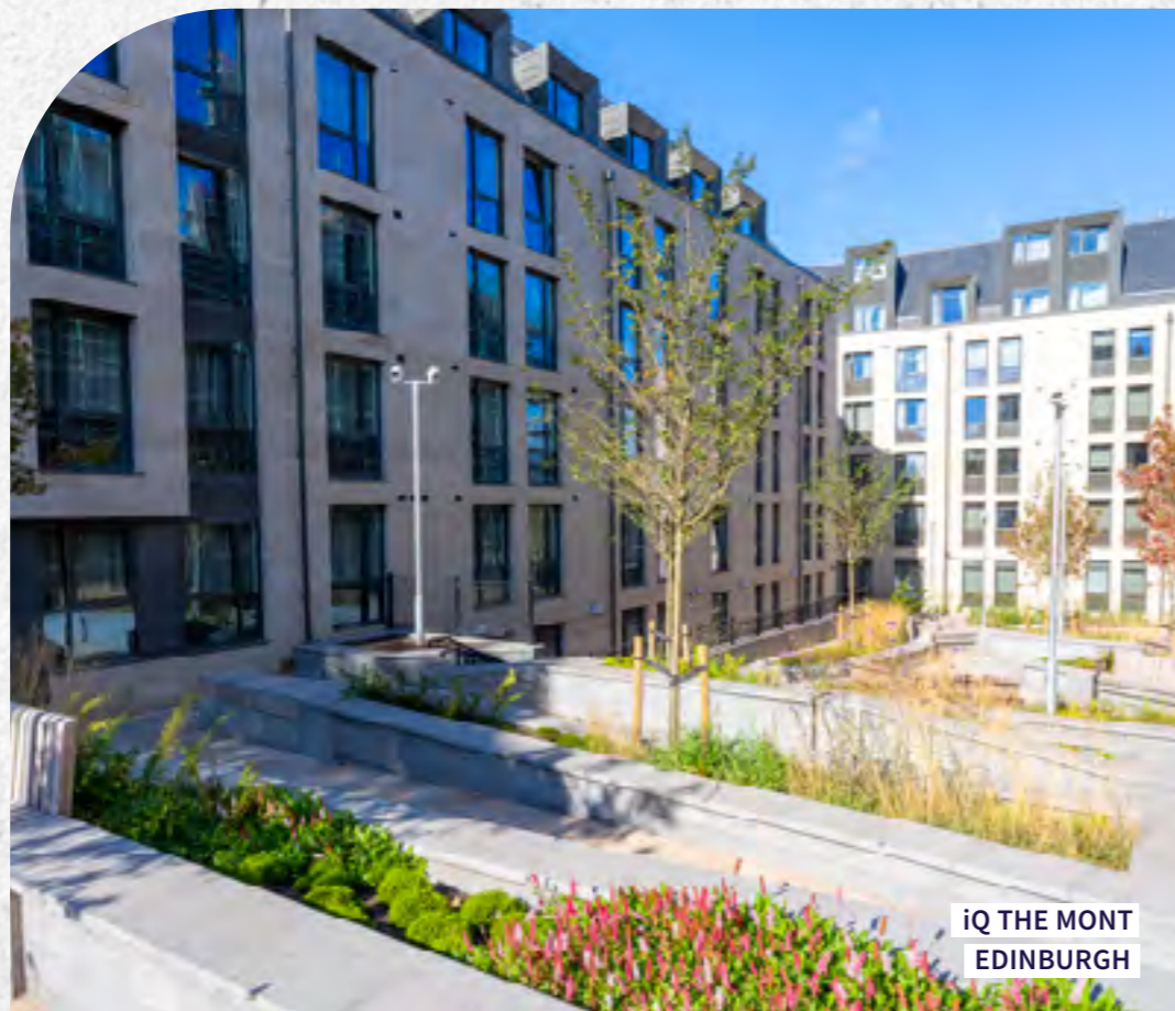
iQ THE MONT EDINBURGH