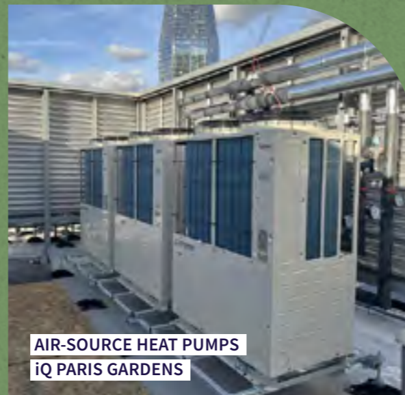
AIR-SOURCE HEAT PUMPS iQ PARIS GARDENS