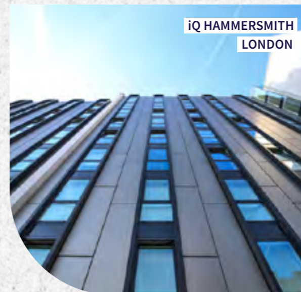
iQ HAMMERSMITH LONDON