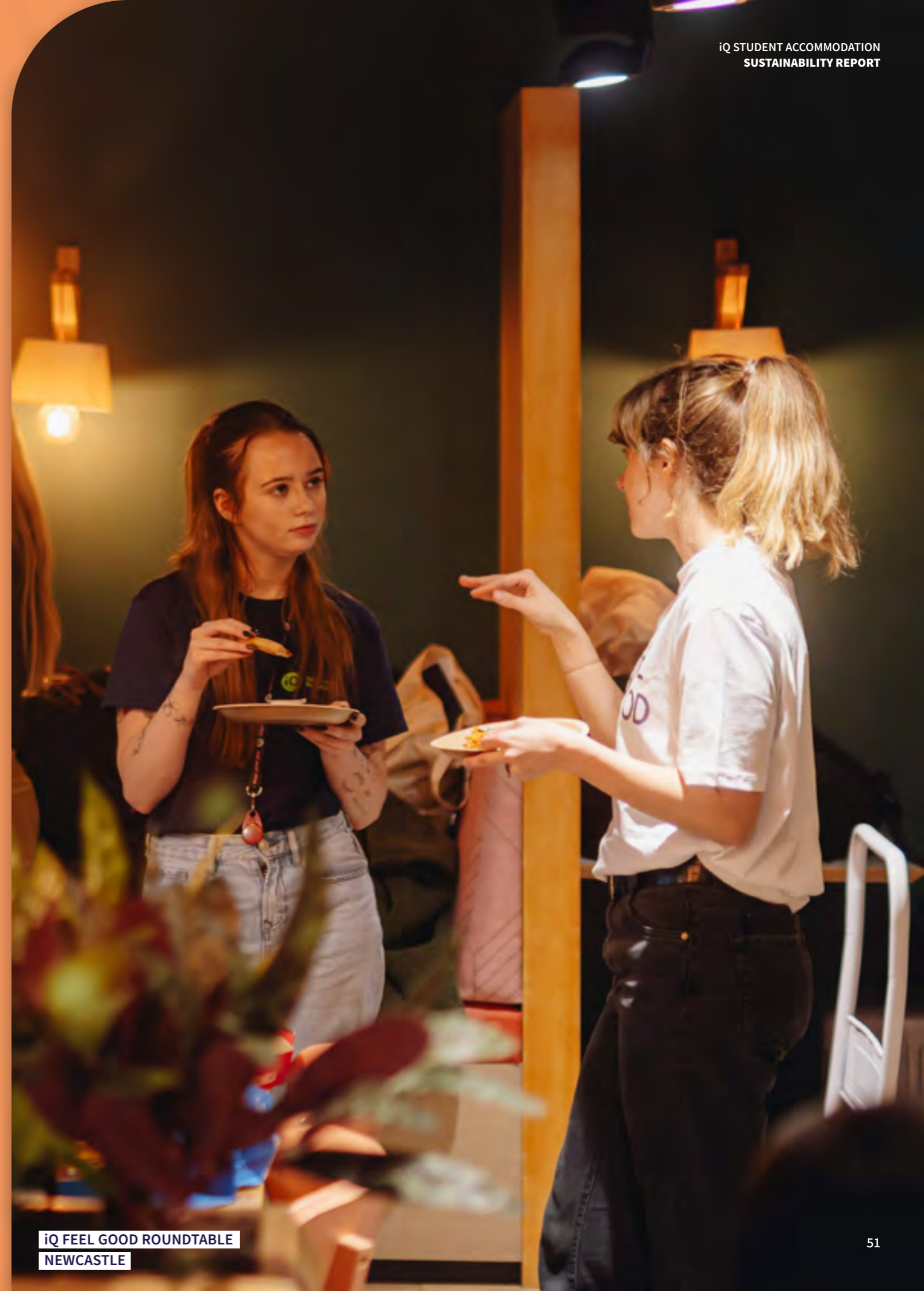
iQ FEEL GOOD ROUNDTABLE NEWCASTLE