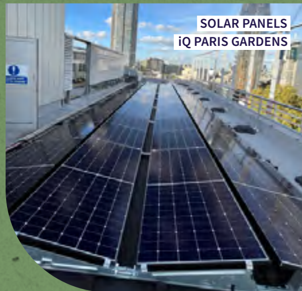
SOLAR PANELS iQ PARIS GARDENS

At Paris Gardens, a 274-bed property located in London, our ambition was to deliver a fully electric building. This included the replacement of the existing gas heating system with 3 new air source heat pumps and the installation of 66 solar panels totaling 34kW and expected to generate 33MWh of electricity per annum.